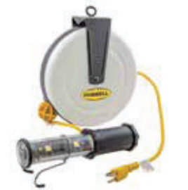
Reel with LED Hand Lamp