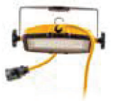
LED Stringer Lights

**Max watts per fixture. HBL142SJ100PS light strings are rated for 1875 Watts total. The total wattage must be considered when daisy chaining lights strings to each other.