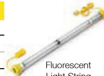
Fluorescent Light String Straps not Shown