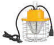
60W High Bay LED Light