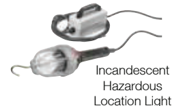
Incandescent Hazardous Location Light