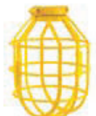
Plastic Guard for Temporary Light Strings