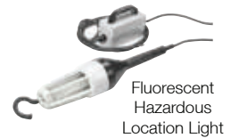
Fluorescent Hazardous Location Light